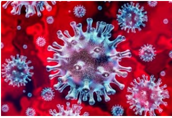
Afbeelding Corona virus